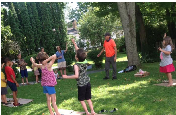
Campfire Songs with Mr. Merritt Summer Read 2020

Registered Library Users: 1,655 Library Visits: 3,875